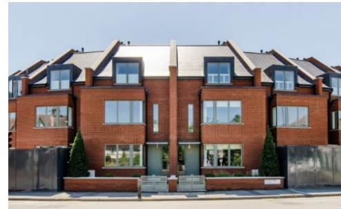
Kingston Road Quadrant