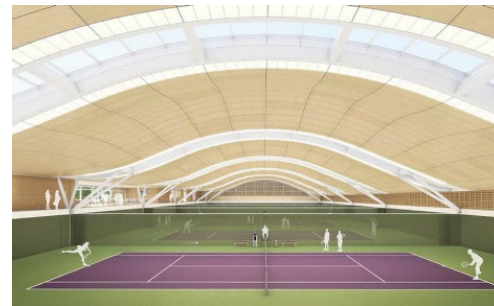
AELTC Covered Courts