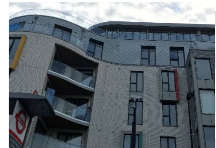
Colliers Wood Library