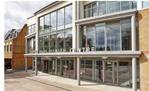
Raynes Park Health Centre