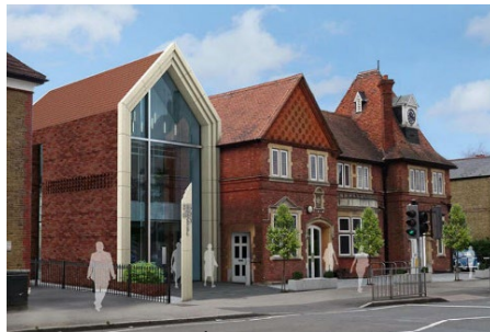
Merton Hall/Elm Church