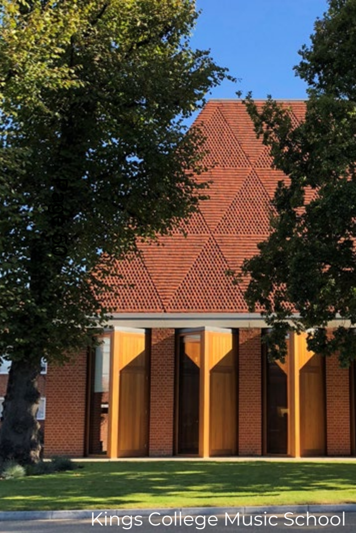
Kings College Music School