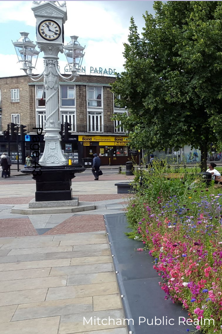
Mitcham Public Realm