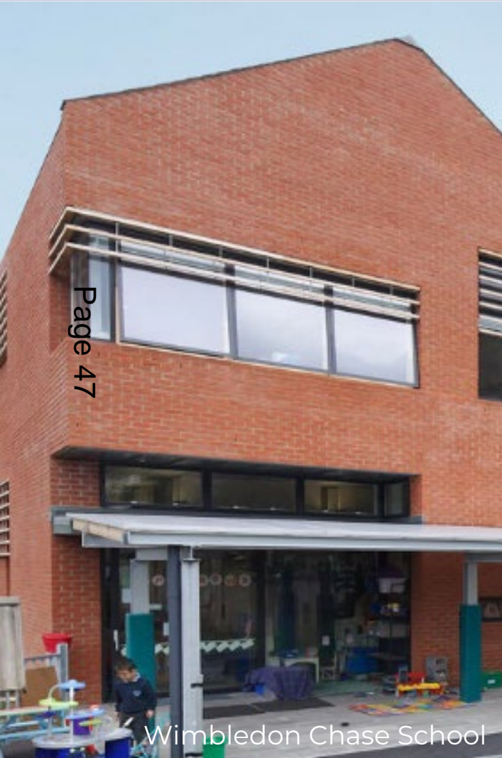
Wimbledon Chase School